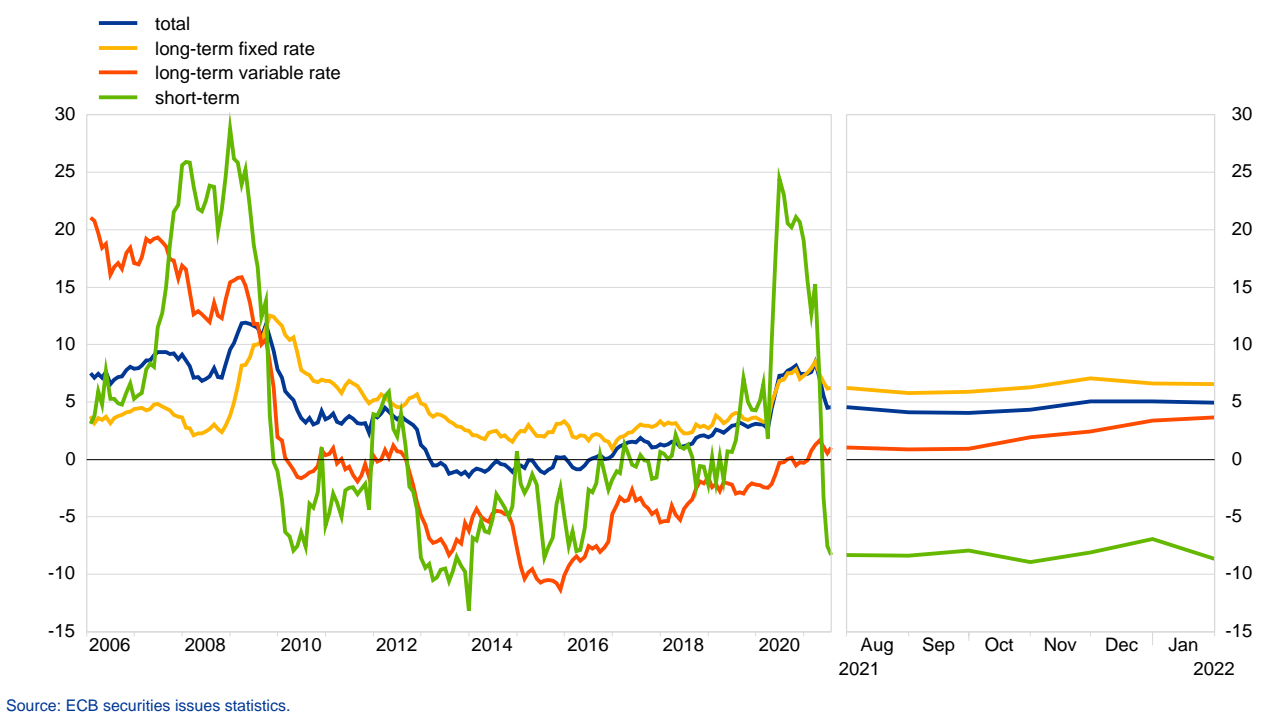
Chart 1: Annual growth rates of debt securities issued by euro area residents, by original maturity (percentage changes)