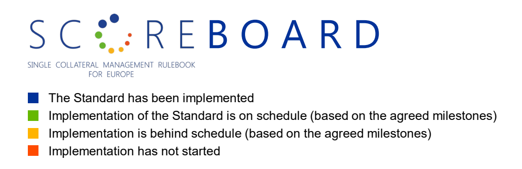
Table 1 Compliance level with the standards by each entity type